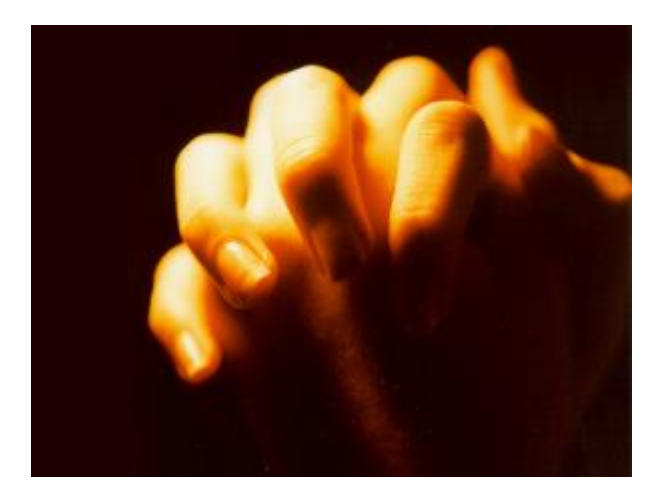
For we walk by faith not by sight

If you would like someone to pray for you please email prayer@iconz4girlz.org.nz